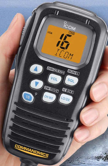
Optional COMMANDMICII™, HM-157B