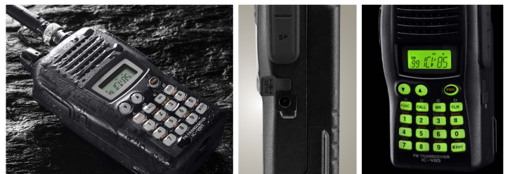
Water resistance, equivalent to IPX4