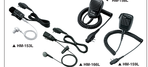
▲ HM-153L ▲ HM-158L ▲ HM-166L ▲ HM-159L

HM-153L : Durable earphone-microphone with revolving clip. HM-158L : Compact and durable body with screw-type connector. HM-159L : Full size durable speaker microphone. HM-166L : Light-weight earphone microphone with revolving clip. SP-13 EARPHONE . Provides clear audio in noisy environments.