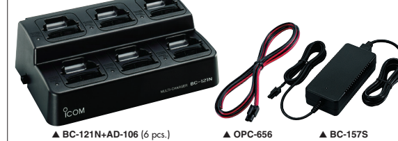
▲ BC-121N+AD-106 (6 pcs.) ▲ OPC-656 ▲ BC-157S

BC-121N MULTI-CHARGER + AD-106 CHARGER ADAPTER + BC-157S AC ADAPTER Rapidly charges up to 6 battery packs (Six AD-106s are required). Charging time: approx. 3 hours when BP-232N is attached.