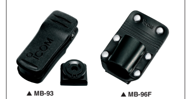
▲ MB-93 ▲ MB-96F

MB-93 : Swivel type belt clip. MB-94 : Alligator type. Same as supplied. MB-96N : Swivel type belt hanger. MB-96F : Fixed type belt hanger.