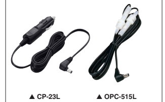
▲ CP-23L ▲ OPC-515L

CP-23L CIGARETTE LIGHTER CABLE, OPC-515L DC POWER CABLE For use with the BC-160 or BC-119N. (12–16V DC required).