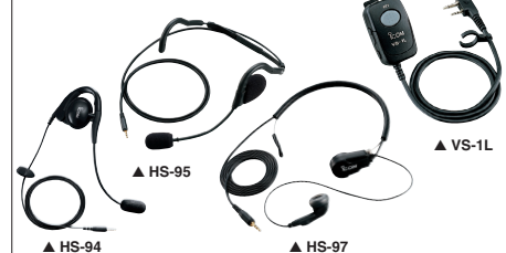
▲ HS-94 ▲ HS-95 ▲ HS-97 ▲ VS-1L

HS-94 : Earhook headset with flexible boom microphone. HS-95 : Behind-the-head headset with flexible boom microphone. HS-97 : Throat microphone fits around your neck and picks up speech vibration. VS-1L : PTT/VOX unit. Required when using these headsets with the transceiver.