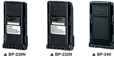
▲ BP-230N ▲ BP-232N ▲ BP-240