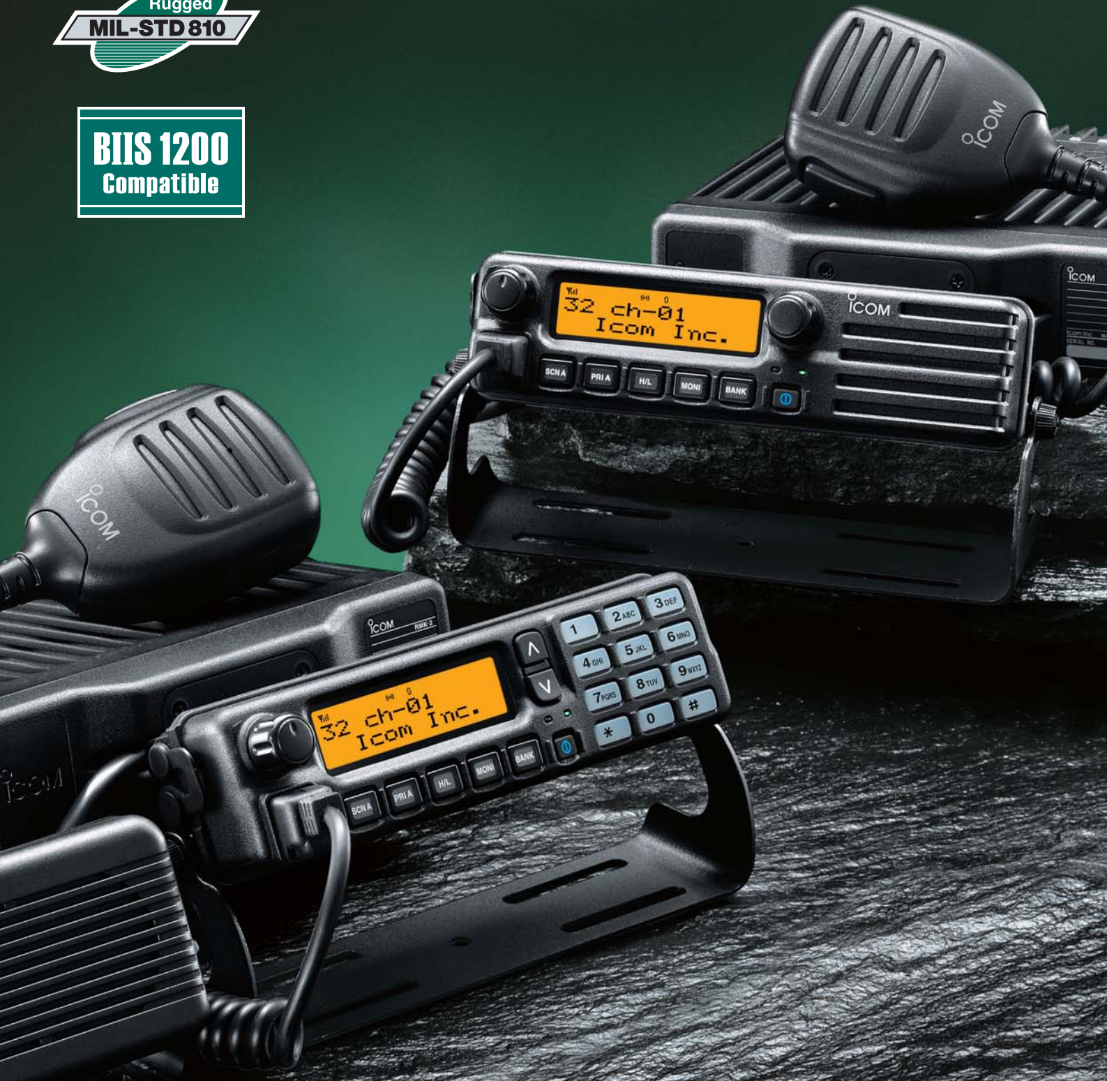
Photo includes optional separation kit, RMK-2 and separation cable, OPC-609.