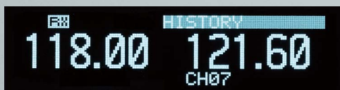
Operating information is clearly shown on the OLED display.

A fixed mount VHF airband first! The IC-A210 has an organic light emitting diode (OLED) display. The OLED display emits light by itself and the display offers many advantages in brightness, vividness, high contrast, wide viewing angle and response time compared to a conventional display. In addition, the auto dimmer function adjusts the display for optimum brightness at day or night.